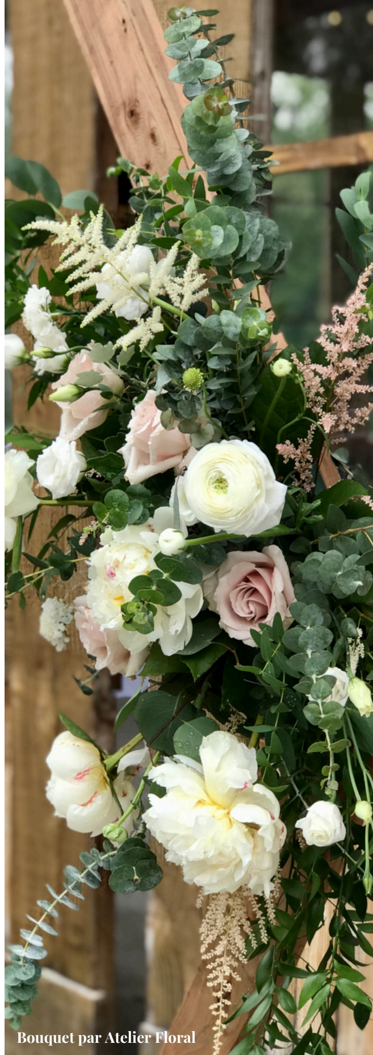
Bouquet par Atelier Floral